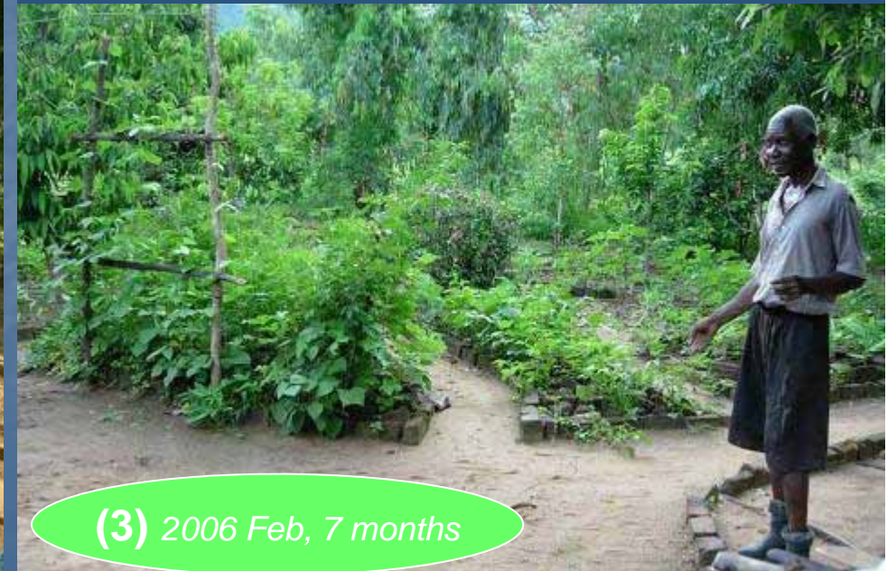
(3) 2006 Feb, 7 months

3) Month 7 : Area flourishing with foods