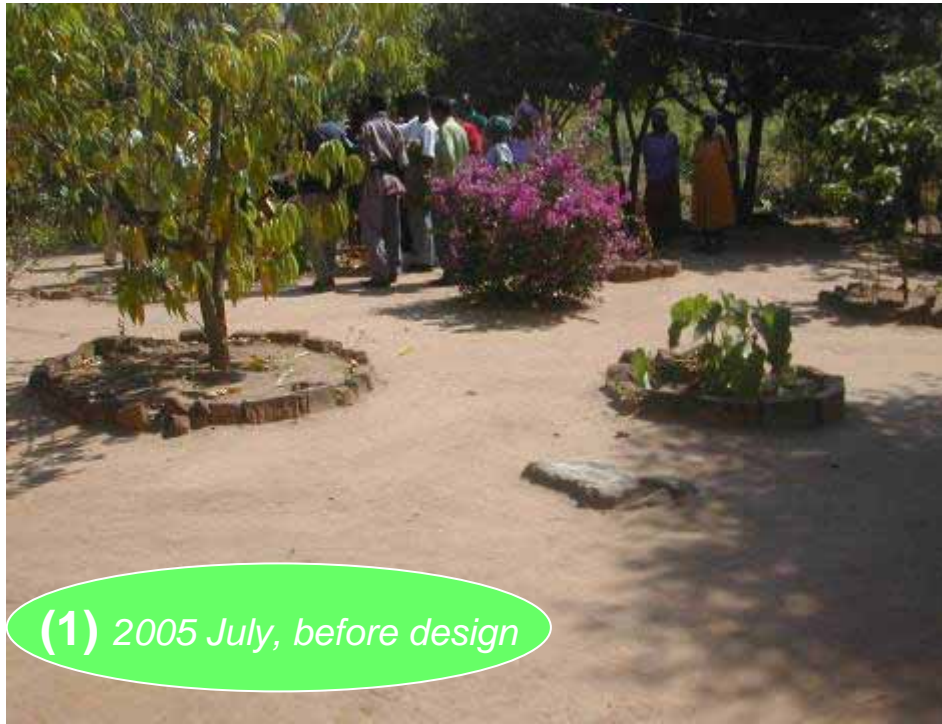
(1) 2005 July, before design