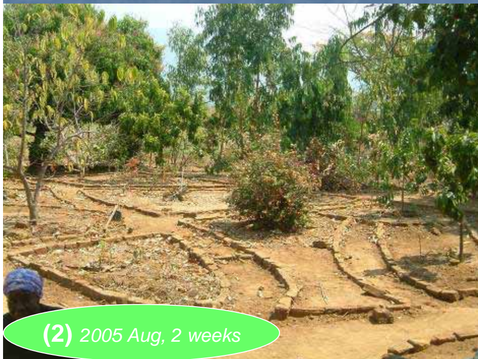
(2) 2005 Aug, 2 weeks